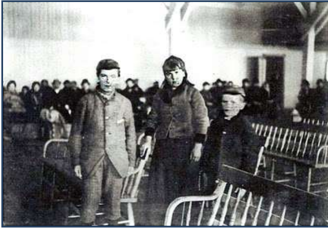
Annie Moore

“From 1820 to 1920, more than 4 million people left their native shores of Ireland bound for the Port of New York and a new life in America. When Ellis Island officially opened on January 1, 1892, the first passenger registered through the now world-famous immigration station was a young Irish girl named Annie Moore. Just 14-years old and traveling with her two younger brothers, Anthony and Phillip, Annie departed from Ireland on December 20, 1891 aboard the S.S. Nevada, one of 148 steerage passengers. The trio would spend 12 days at sea arriving in New York on Thursday evening, December 31.”